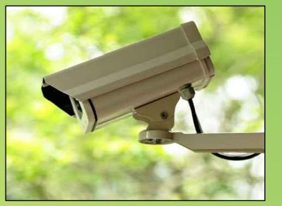
24 X 7 SECURITY